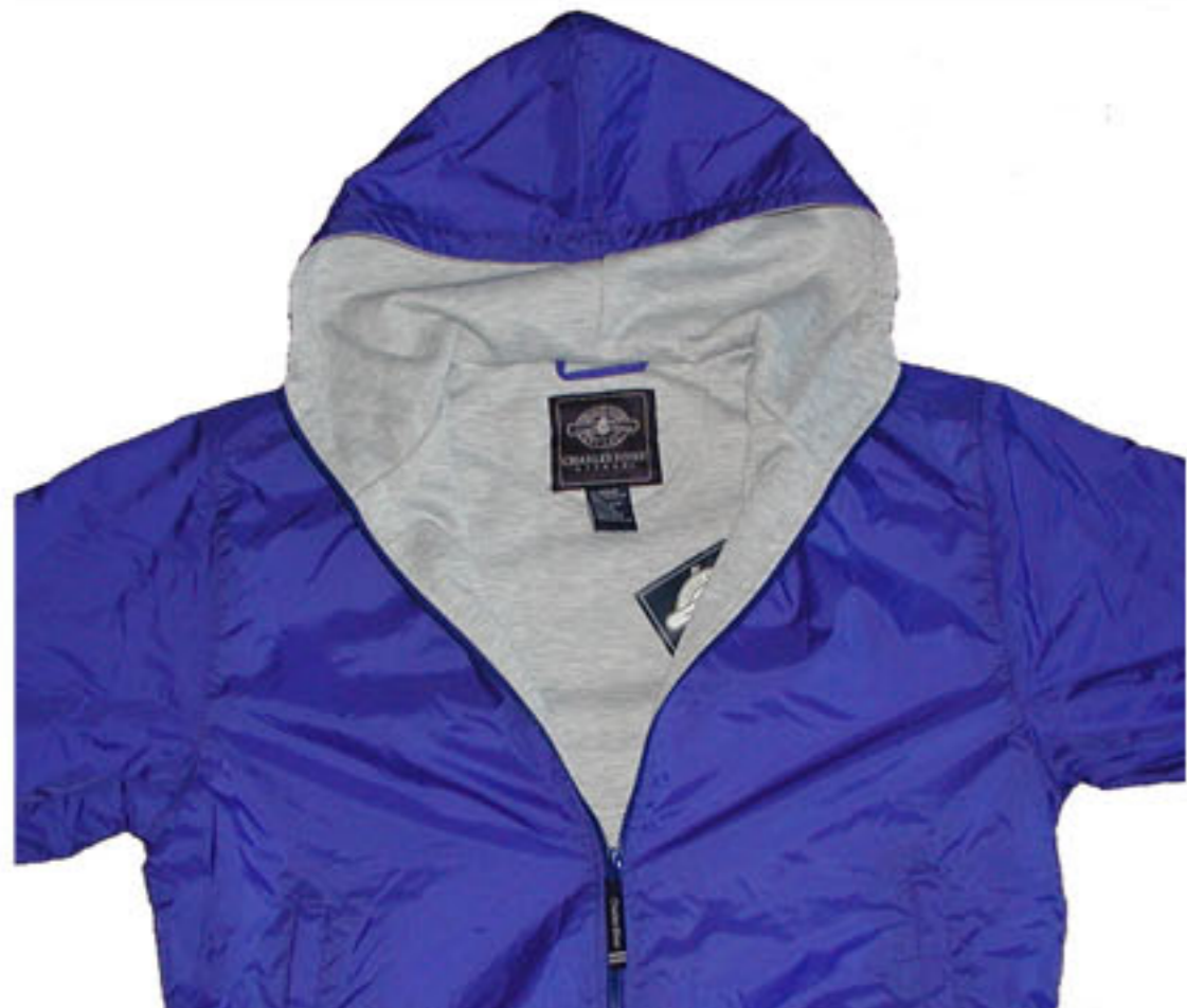
NBAC Lax Charles River Jacket