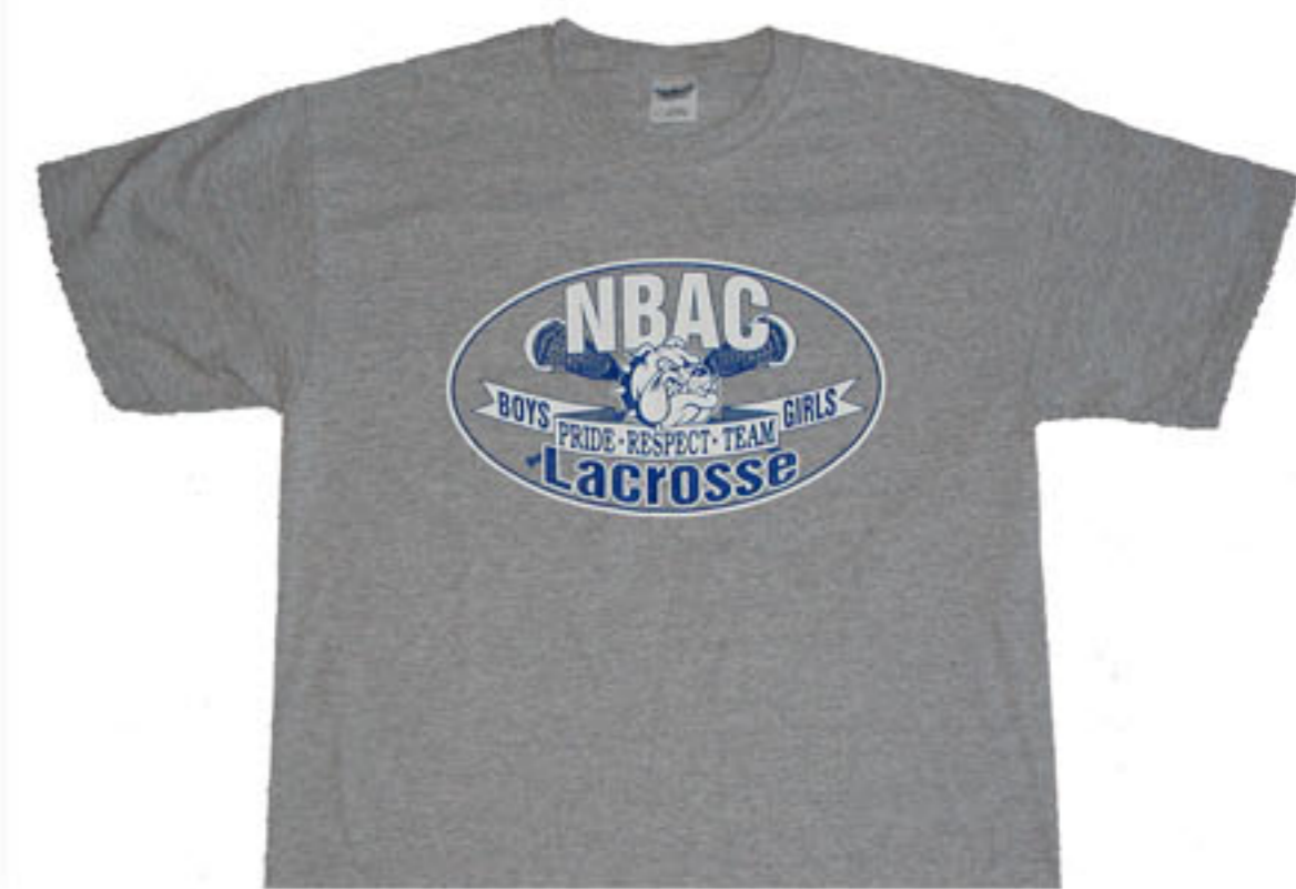
NBAC Lax TEE Shirt