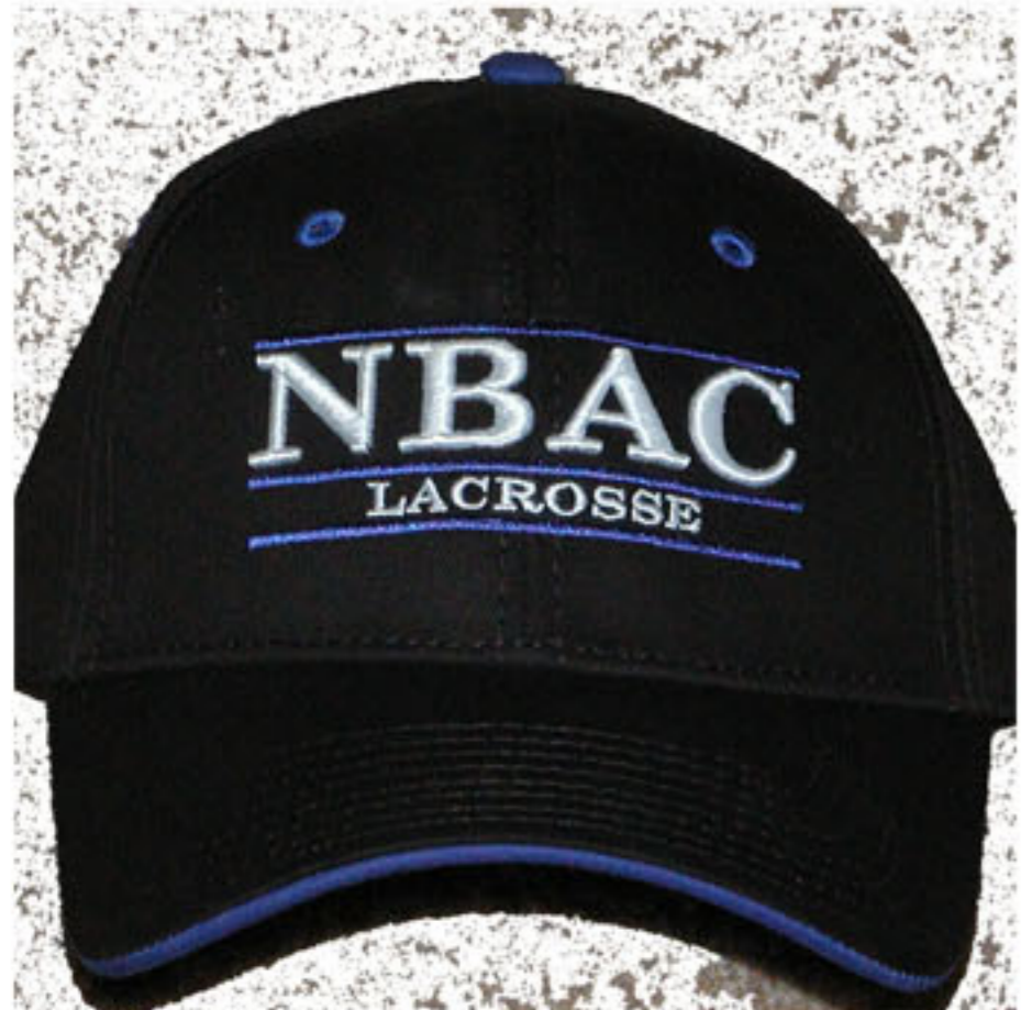
NBAC Lax Cap