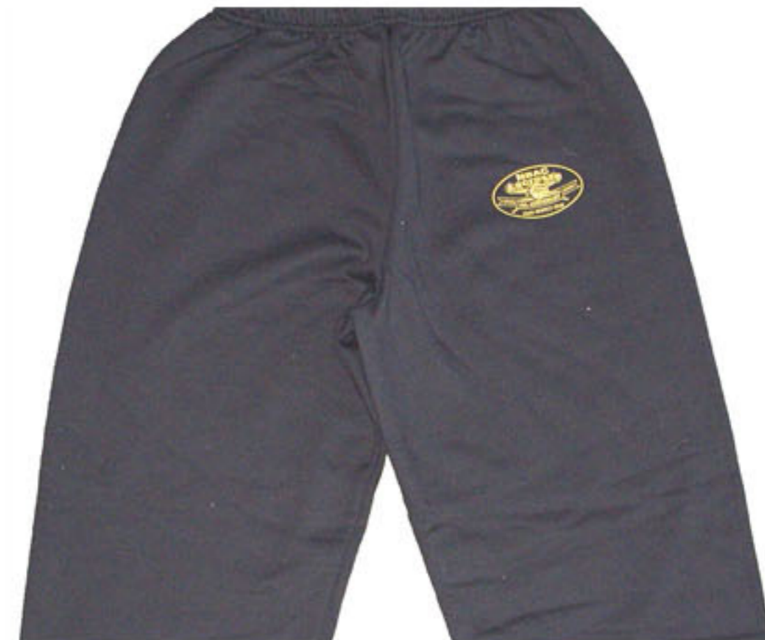
NBAC Lax Sweat Pants