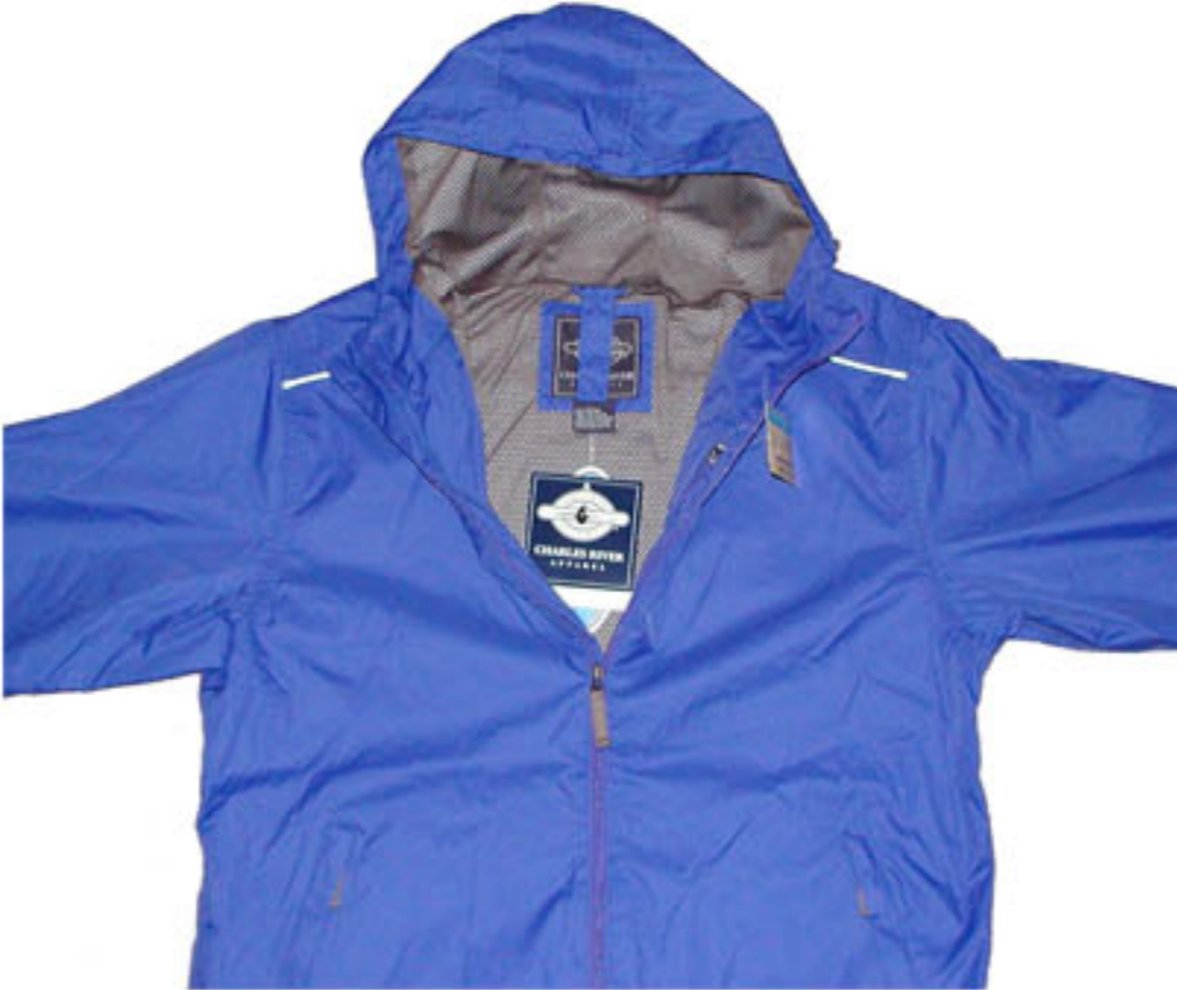
NBAC Lax Charles River Rain Jacket