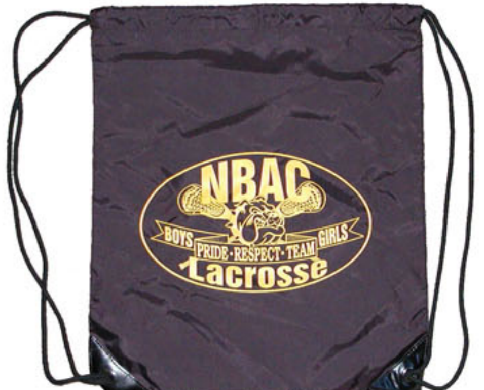
Draw String Bag