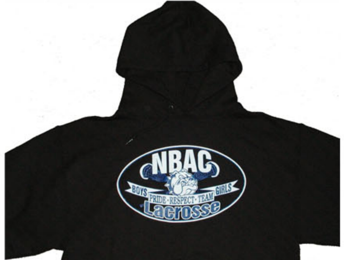
NBAC Lax Pull Over Hooded Sweatshirt